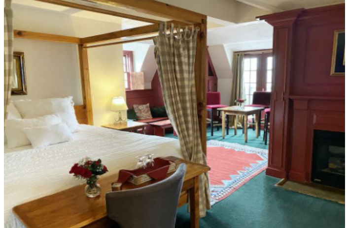
King Large Suite

See all room photos at redlioninn1704.com/reserve-a-room